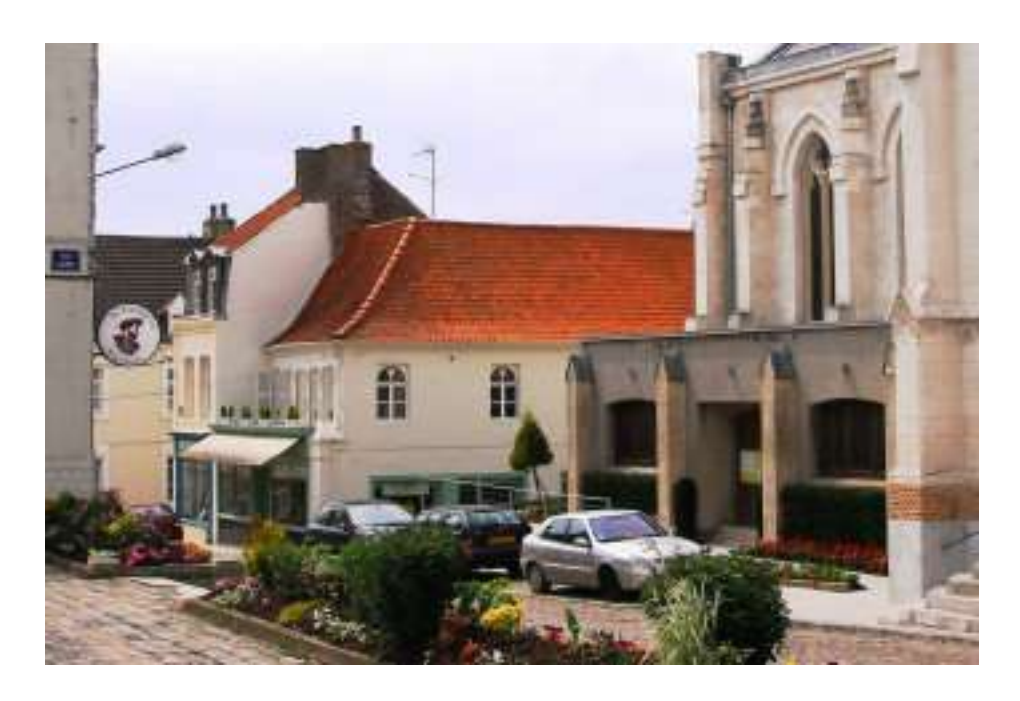
Boursot's Wine Collection in Ardres